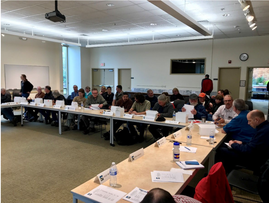
Bikeway Advisory Group Meeting—April 25, 2017