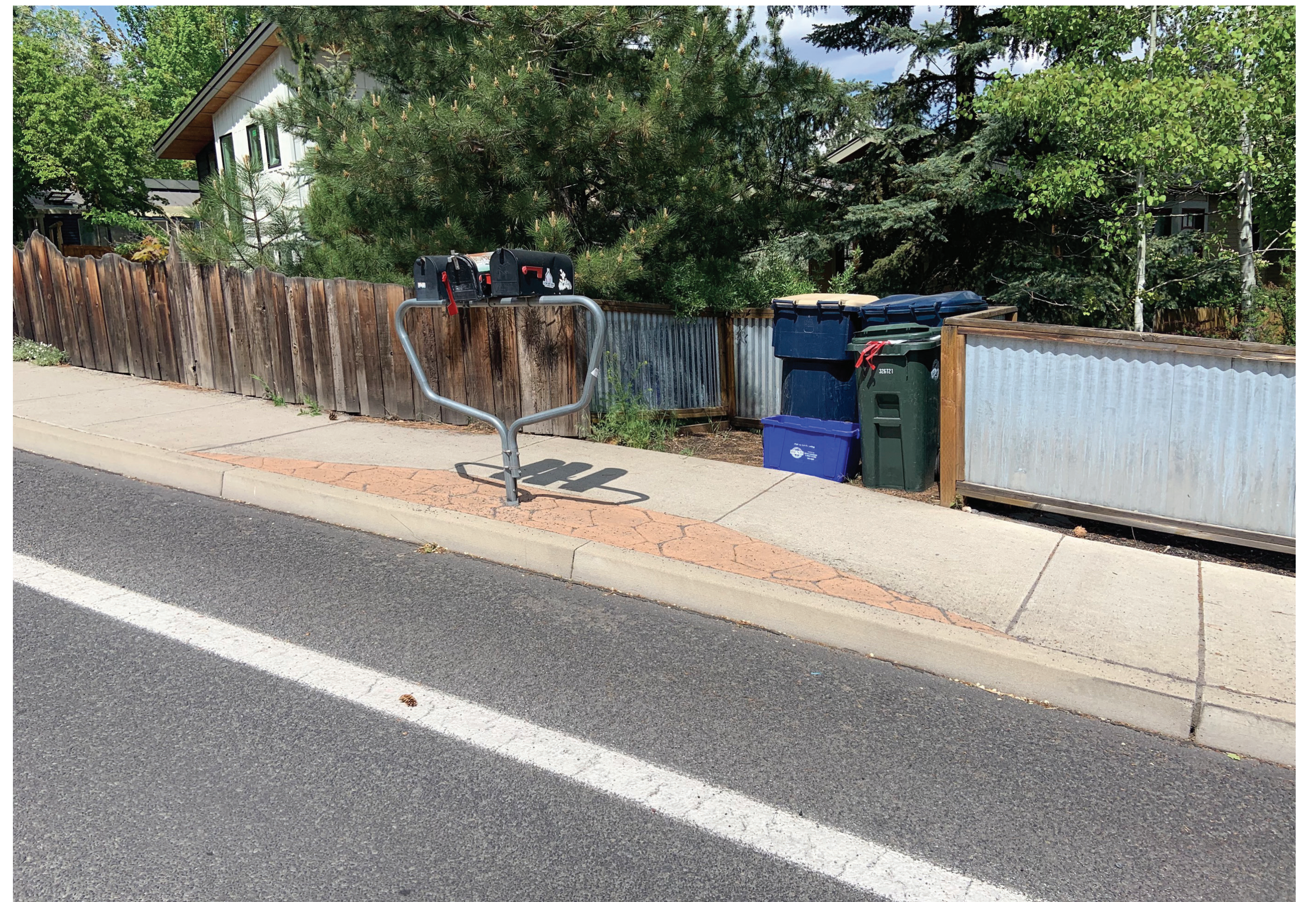
Sidewalk Buffer For Mailboxes And Garbage Cans