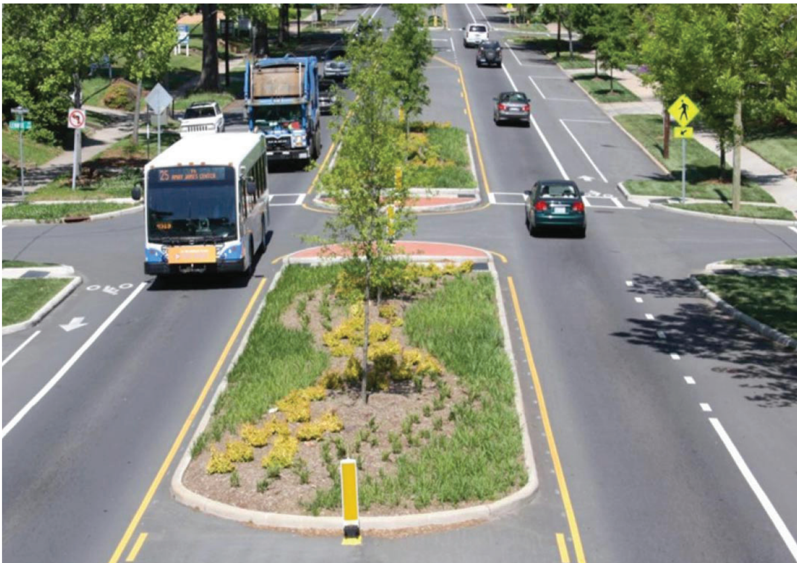
Midblock Crossing with Refuge Island